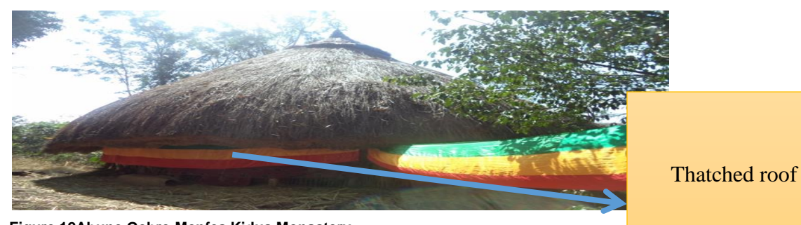
Figure 12Abune Gebre-Menfes Kidus Monastery

When the first monastery was built the roof of the building was thatched and the building still had a thatched roof, by this case, the monastery is unique because it keeps its design and materials which are constructing the church. The thatched roof was changed by similar materials when the thatched was damaged (KI 1, April 03, 2023).