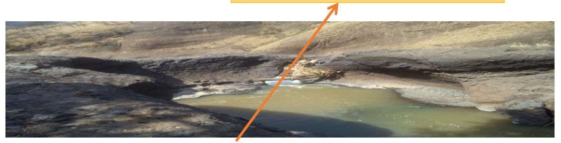
Figure 2Senago Natural Bridge

This rock connected the left and the right-side rock