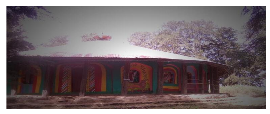
Figure 13 Debre Bisrat Dingra Mariam Monastery