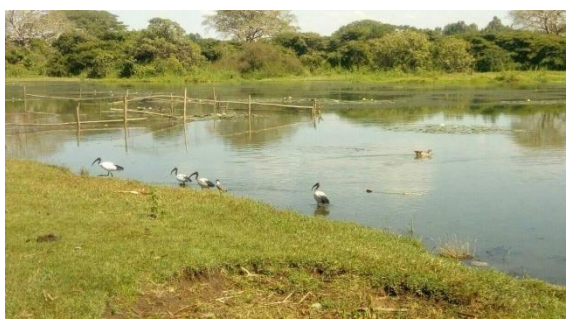
Figure 9Geray Man-Made dam and Lake