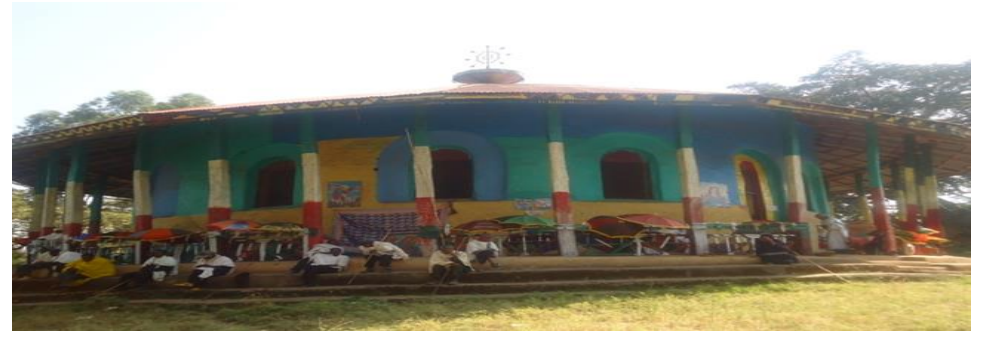
Figure 11Guwansa Medhani Alem Andenet Monastery

As the researcher observed during a field observation, the location of the monastery, the fact that it is favorable for the development of tourist infrastructure, and the presence of various attractions around the monastery have great potential for turning the monastery into a source of income. In addition, the monastery is in close proximity to the city of Mankusa and many people go to the monastery because the monastery has 5 churches and 5 spas. The five spas found in Guwansa Medhani Alem Andenet Monastery are Medhanialem Spa, Kristos Samra Spa, Arsema Spa, Kidane Mhret Spa, and Urael Spa, which are available at the monastery.