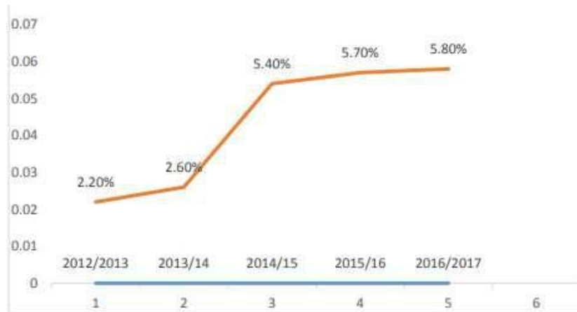
Figure 1. The magnitude of thyroid cancer among thyroid swellings in patients of JUMC over the past 5 years: from September 2012 to June 2017.