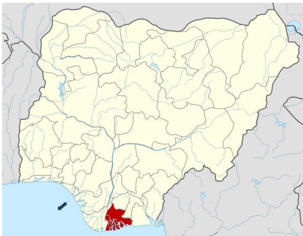
Figure 1. Map of Nigeria showing Rivers State.