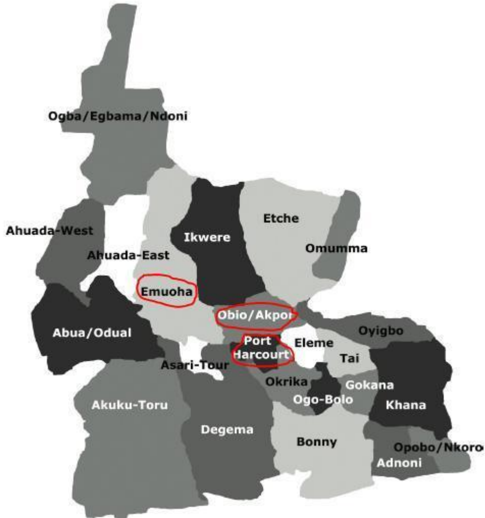
Figure 2. Rivers State showing all the LGAs with the study sites in red circles.